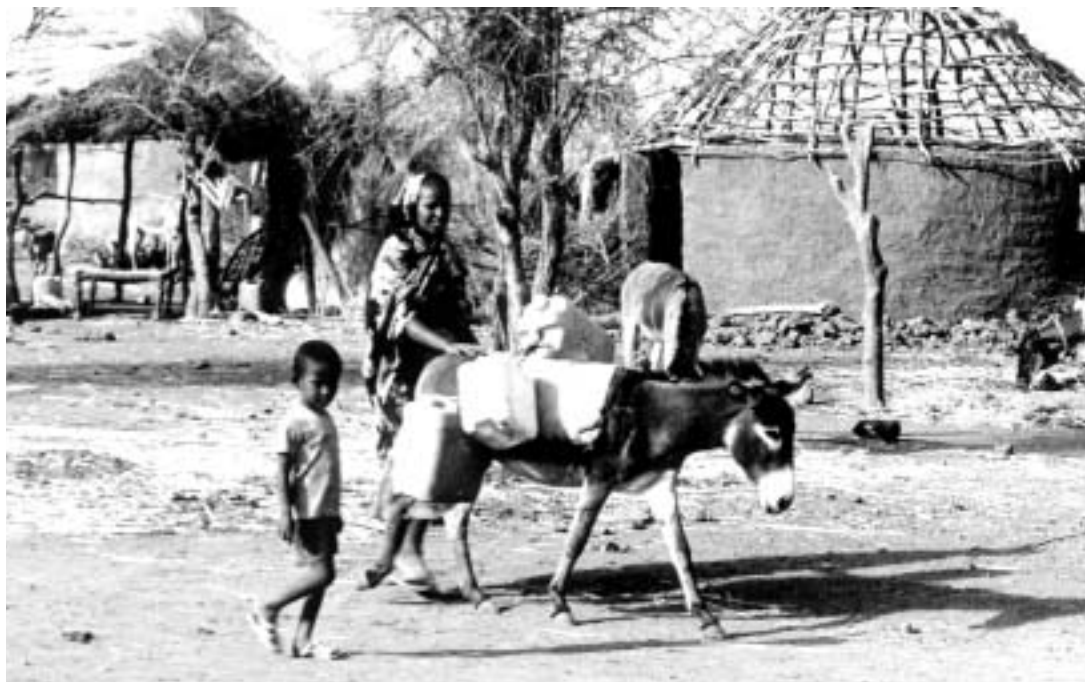
Photo 1: A donkey supplied by PROFERI being used to carry water, Goulge resettlement site, Gash Setit province, Eritrea. In the background a new returnee house is being constructed